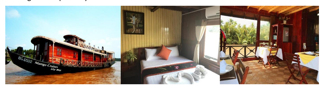
Day 2: Vung Liem – Tra on (B, L, D)

Relax and freshen up for your cooking demonstration and dinner on board. The rest of the evening will be spent at your leisure.