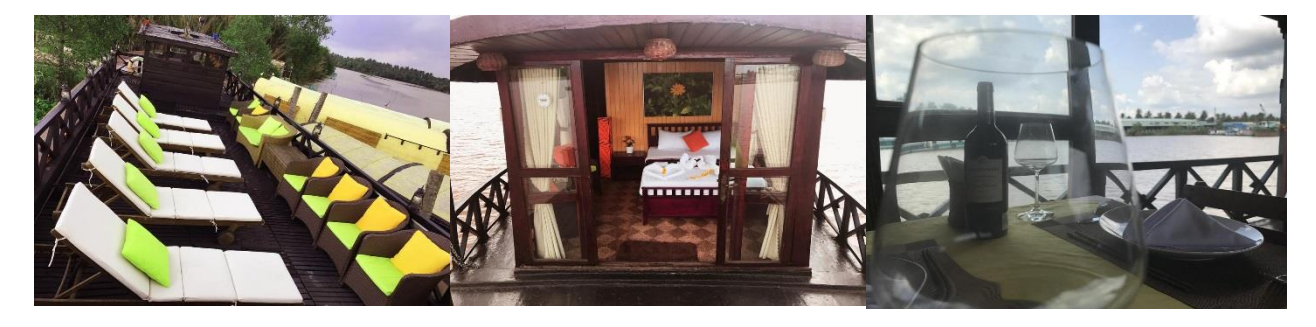
DAY 3: Tra On – Cai Rang – Can Tho (B)